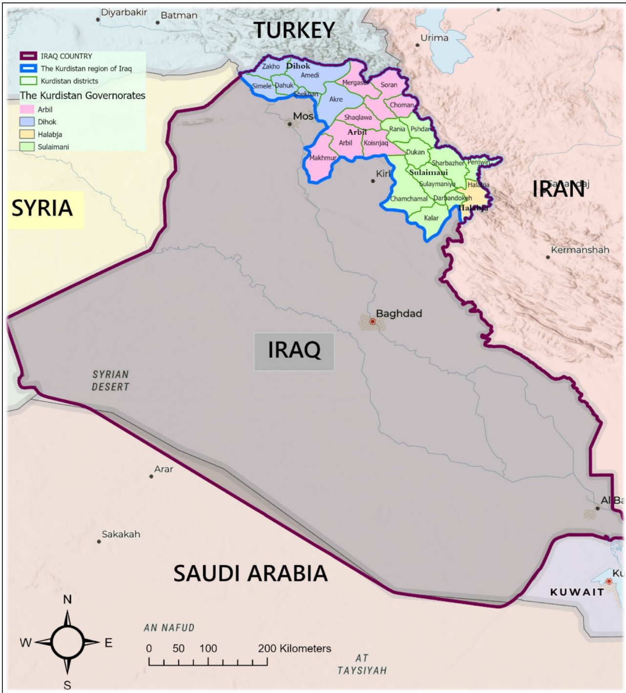
FIGURE 1 The Kurdistan region of Iraq on the Iraq map

preparedness. The functions that instead facilitate implementation of the core activities were identified as support functions, namely standards and guidelines, training, supervision, communication facilities, resources (human, financial, logistical), and coordination between stakeholders. To test the validity and reliability of the survey, a pilot study was conducted in the Sulaimani governorate. The duration of the study was from June 2019 to March 2021.