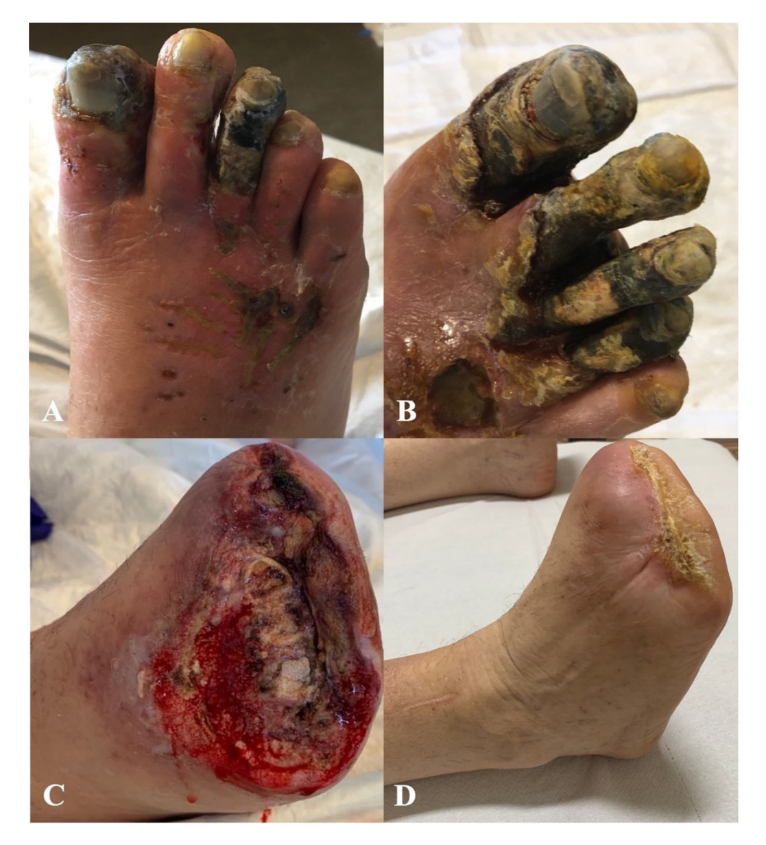
Figure 3. ( A , B ) Extensive forefoot gangrene; ( C ) open trans-metatarsal amputation performed after arterialization, avoiding primary closure according to the "tension-free" surgical approach; ( D ) complete healing of the amputation wound after VAC therapy.

Here, SFA = superficial femoral artery; GSV = great saphenous vein; CFA = common femoral artery.