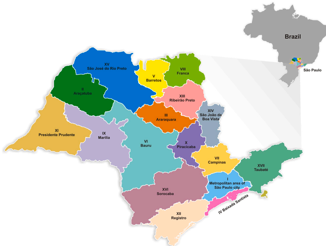
Fig. 1. Division of the São Paulo State in Regional Health Departments. The São Paulo State is divided in 17 Regional Health Departments which are identified by roman numbers.

From February to August 2021 the Network for Pandemic Alert of