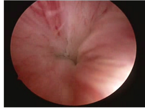
FIGURE 3: Coapted bladder neck.

However, ureteral reimplantation is effective in reducing postoperative pyelonephritis (POP) [7], UTI is the most common complication. There is surprisingly little literature describing the long-term clinical outcomes after UR. The International Reflux Study in Children (IRSC) prospectively compared the effects of successful surgery and effective medical management on the incidence of UTIs. During a followup of 5 years, that study reported an incidence of 38% of infections of the lower urinary tract among conservatively treated patients, compared with 39% among those treated by surgery. The incidence of pyelonephritis was 21% and 10%, respectively, and was statistically significantly different [8]. In another long-term, retrospective study of patients 10 years after UR, Beetz et al. found that, among the 83.5% of patients they could contact, 17% had experienced postoperative febrile UTI [9]. In contrast to these high rates of POP, Whittam et al. reported in a recent series that of 395 patients who underwent UR febrile UTI were diagnosed in just 4.6%, although the follow-up time was relatively short at a mean of 15 months [10]. Accordingly, Cooper and Atwell reported an incidence of 37.6% of UTIs among 96 women who had ureteric reimplantation in childhood and who were followed for 16–25 years afterward [11]. As emphasized by Mor et al., there is a need to establish a protocol for the long-term followup of patients who have had